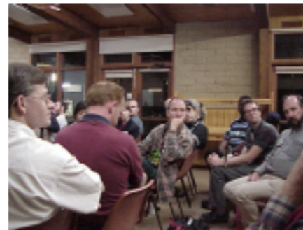
ICCM AU 2000