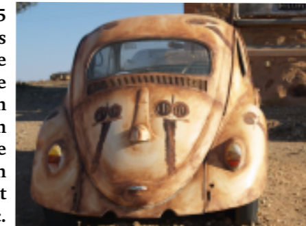
Cont'd Page 2

So to avoid the wind, we drove from the Eyre Peninsula back to the Clare Valley, and stayed in Clare. We spent the next 5 days wine tasting which was great. Then it rained, so we left and drove back to the Eyre Peninsula, staying in Cowell in our 2 man tent, where it again rained. Hmm. Next day we travelled to Coffin Bay, which was protected from most winds, and very scenic. Oysters and fishing is all the thing there, so we had some