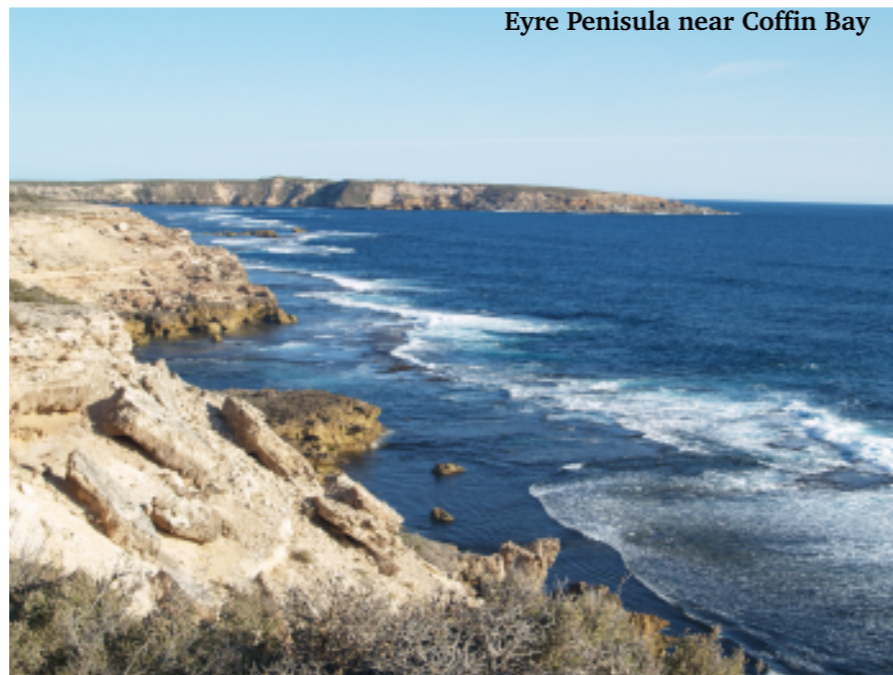
Eyre Peninsula near Coffin Bay

Just a note about our month in South Australia. We had a great time. Camping is a challenge at the best of times but with the wind even more so. Sally really enjoyed it too and was a bit bored